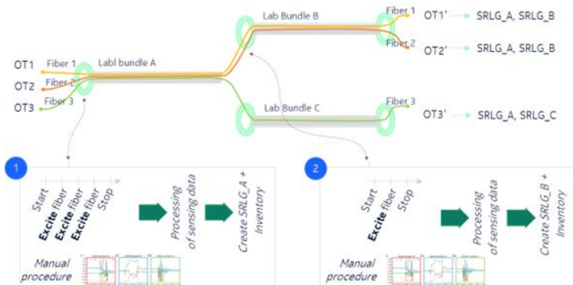
Figure 2: Shows the two methods for measurement

In summary, Approach 1 is more granular and precise, whereas Approach 2 is faster and more efficient for bulk processing.